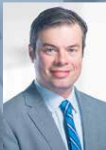
Joshua Nesser Contributor: "IRS Practice & Procedures"